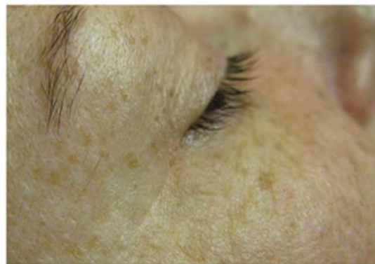
After one clinical treatment